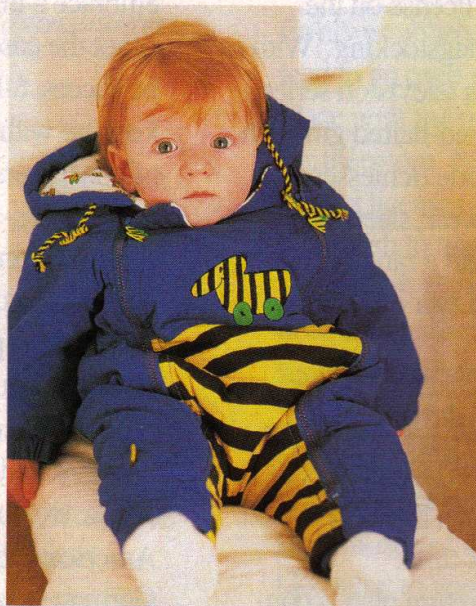
A jumpsuit featuring Janosch, a character licensed by Bavaria Sonor.